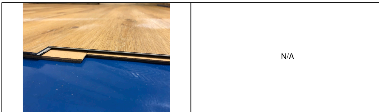
Illustration / drawing for sample assembly